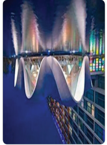
La Concha Renaissance San Juan Resort